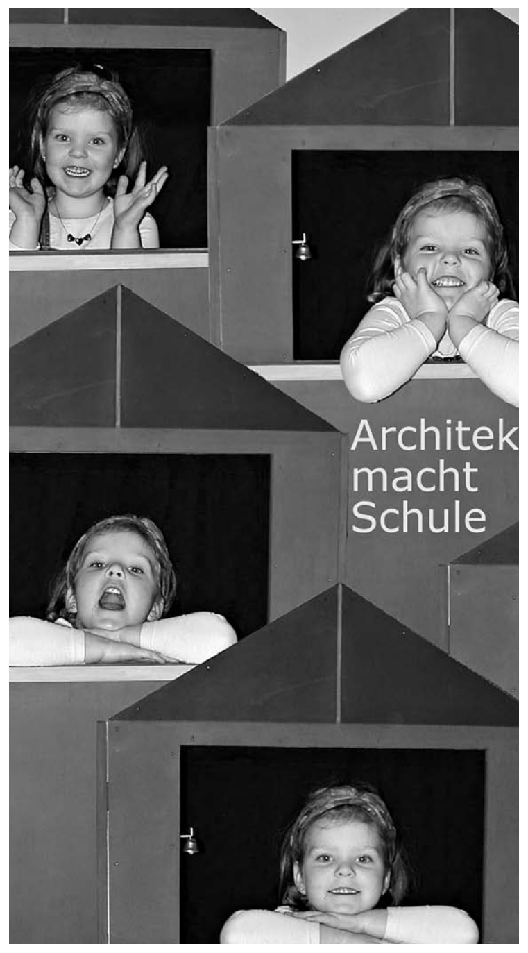
How children like to live, poster of the course 2003